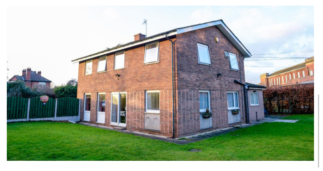
June - July 2020

What a strange few months we have all had! Some of us have remained at home whereas others have been in school and residence. Regardless of where we have been, we have all managed to keep in touch, which has been great. We are all looking forward to September, when hopefully things will be a little bit more 'normal', well the new normal anyway!